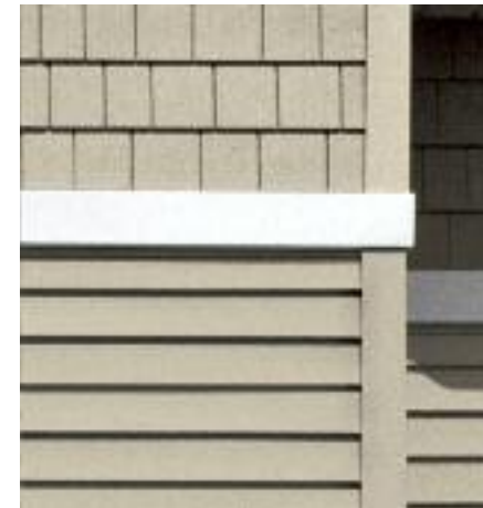
Horizontal band board provides a strong horizontal accent.

ChromaTrue ® Chroma True helps make Board & Batten better with ASA weatherable polymers which provide superior fade resistance and better performance on darker colors.