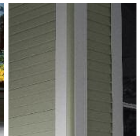
Trimworks® three-piece beaded corner post.