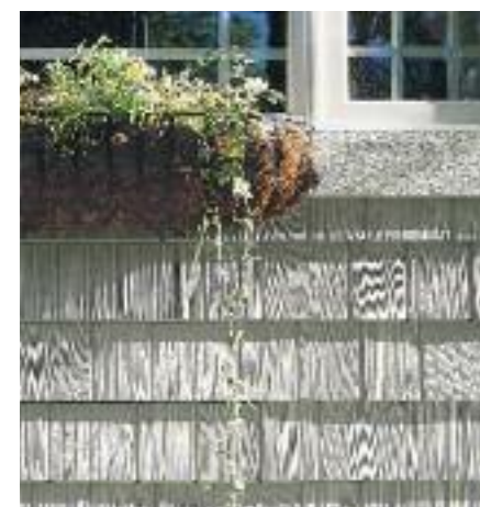
Alside Premium Shakes – the classic look of deep-grained cedar shakes.