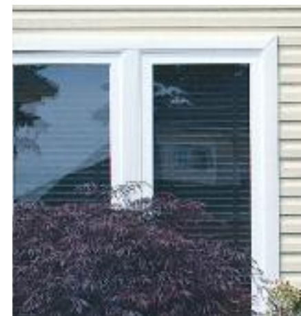
Trimworks® 3 1/2" window trim.