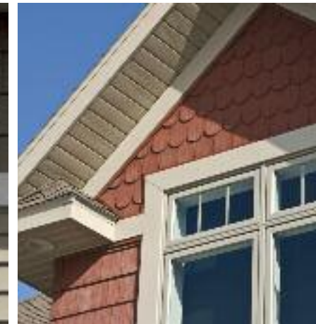
Alside Premium Scallops – Victorian inspired half-round shingles.