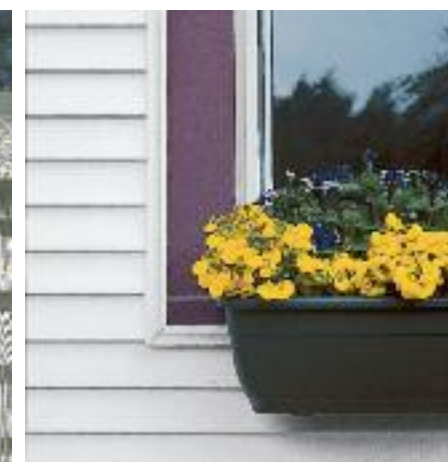
Trimworks® custom crown molding used with wood window trim.