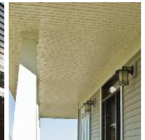
Charter Oak® invisibly-vented soffit.