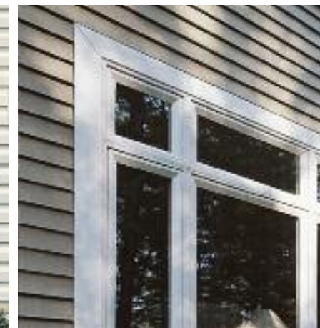
Trimworks® 5" window trim.