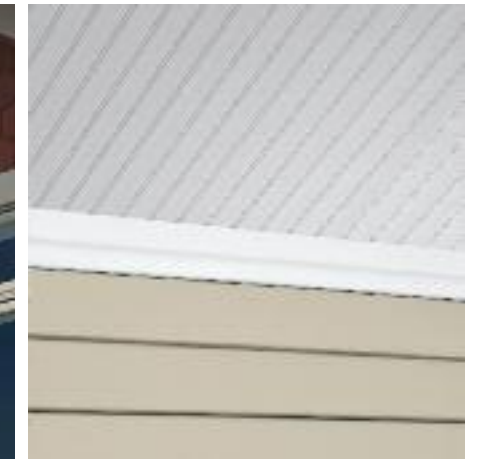
Greenbriar® Vintage Beaded soffit and Trimworks® soffit crown molding.